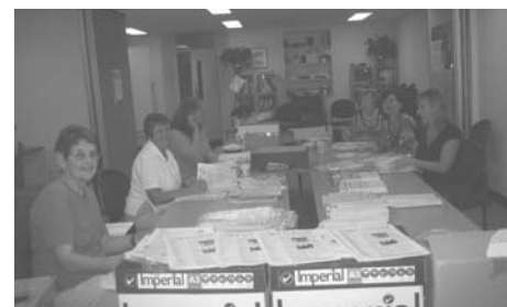
Volunteers prepare Forum for mailing

Volunteers were a vital part of the founding of our association and are just as important today. We have volunteers from all walks of life who assist us in many ways. Volunteers help us in administration of our offices at Gladesville, in the preparation of mailings for Forum, appeals and merchandies. Many of our volunteers sell merchandise for us and hold fundraising events. They are always ready to lend a hand when needed.