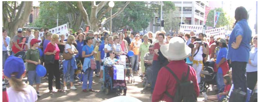
Sydney March of MND Faces - Hyde Park to Parliament House - 2 April 2005

A huge thank you to everyone who turned up for the March of MND faces on Saturday 2 April at the start of MND Week. It was kind of the Footy Show, Alan Jones and Column 8 to broadcast the event and attract some extra foot soldiers. Equally, the Police, Maxi Taxis and the City of Sydney have to be thanked for giving the necessary permissions and backup.