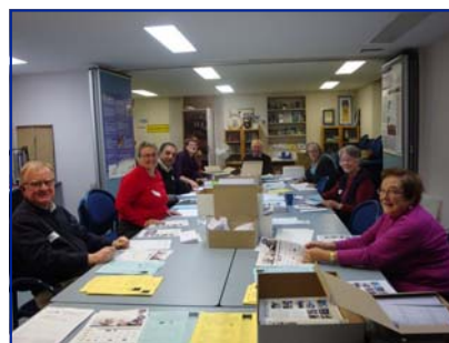
Our Forum packing volunteers packaging June 2015 edition.